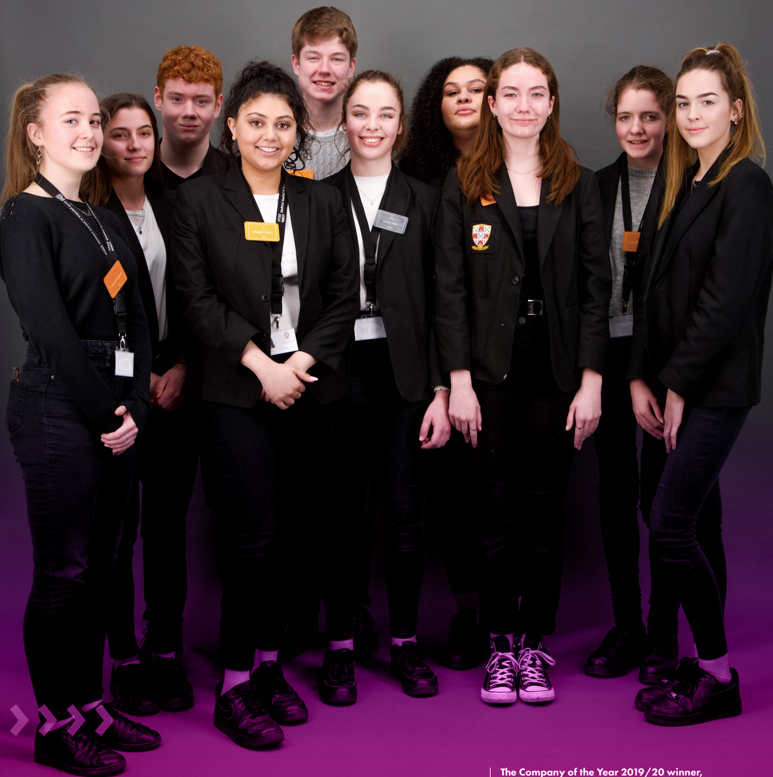
The Company of the Year 2019/20 winner, EnviroTent created an innovative, sustainable product that is the only cardboard tent in the UK. The team from King Edward VI School went on to represent the UK at the JA Europe Company of the Year Competition 2020.

Student companies will have opportunities to compete in competitions at a local, county, regional and national level, offering a variety of learning development opportunities including public speaking, interview skills and a chance to network with other companies locally, regionally and across the UK.