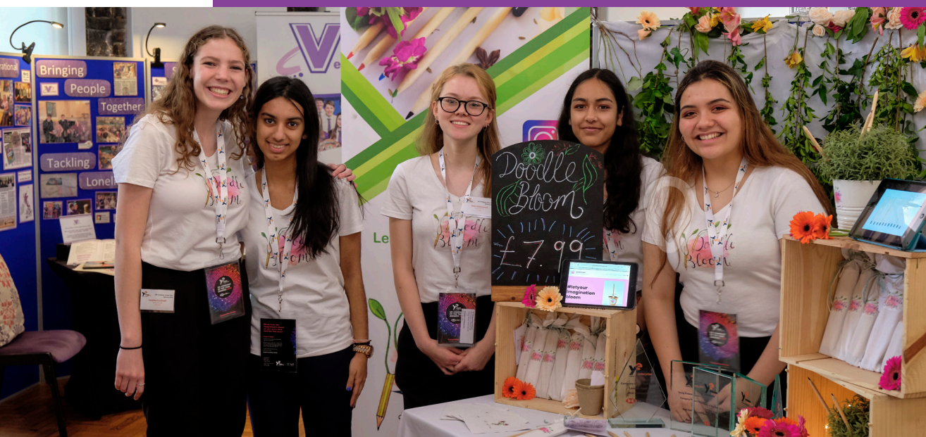
Doodle Bloom, won the FedEx Europe Access Award for the international reach of their product - plantable coloured pencils, at the national finals in 2019.

You can find further resources on supporting students with Milestones 2-8 on YE Online .